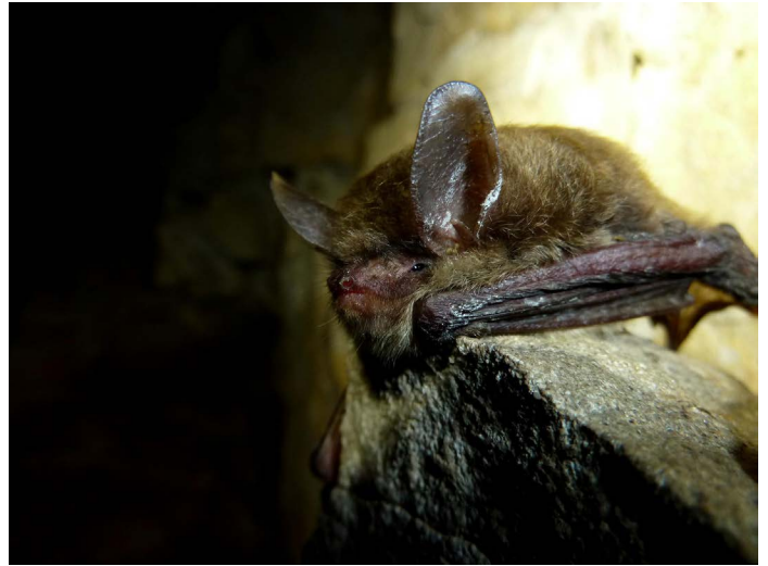
Northern long-eared bat

A deadly disease called white-nose syndrome is putting northern long-eared bats on a fast-track toward extinction, causing their numbers to plummet by as much as 99 percent in some areas in just the eight years since the disease was first found in the United States. In spite of these alarming statistics, the Service backpedaled from its original proposal to list the northern long-eared bat as endangered, 37 bowing to industry pressure by giving the bat less protection as a threatened species and simultaneously issuing an interim 4(d) rule green-lighting activities that kill and harm the species. 38