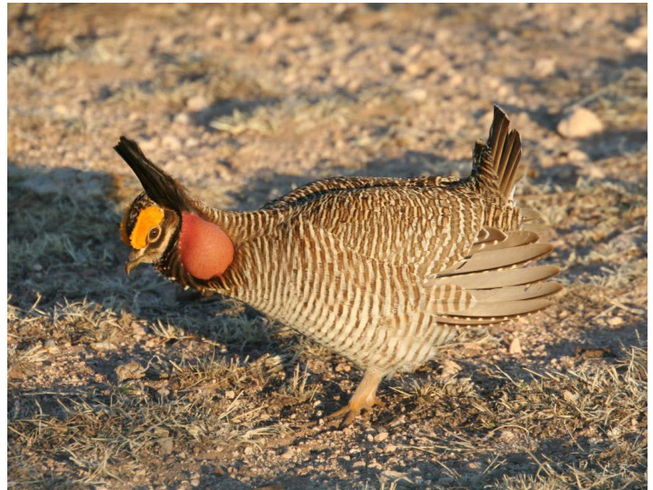
Lesser prairie-chicken

Once common across the southern Great Plains, the lesser prairie chicken is thought to have numbered up to 2 million birds, ranging across more than 180,000 square miles in Colorado, New Mexico, Kansas, Oklahoma and Texas. The remaining prairie habitat in this region has been severely fragmented by agriculture and industry. Wind turbines, oil and gas wells and associated roads and transmission lines are now also spreading across the landscape. The lesser prairie chicken survives in just 8 percent to 16 percent