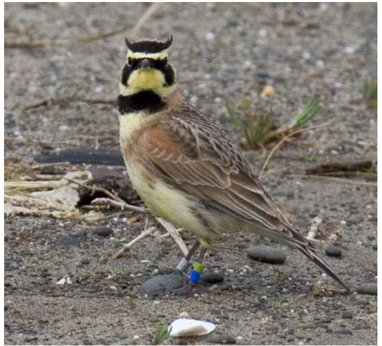
Streaked horned lark

The species has been lost entirely from much of its range, including Canada, the San Juan Islands, Oregon coast and Umpqua and Rogue valleys. 49 Only a small fraction of remaining lark habitat is in protected hands, and most of the remaining, scattered lark populations are clinging to survival in places that are far from ideal. Five of six nesting sites left in the Puget lowlands are next to airports and military airfields, and four nesting sites are found at municipal airports in the Willamette Valley. 50 This includes the single biggest nesting population, which is just 75 to 100 pairs, found at the Corvallis Municipal Airport. 51 The largest amount of potential winter habitat is in Oregon's Willamette Valley where agriculture is the dominant land use, 52 and this land has never been surveyed for